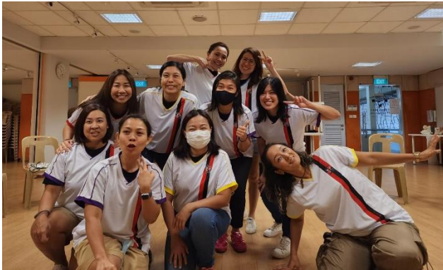
Teacher's Day Music Video