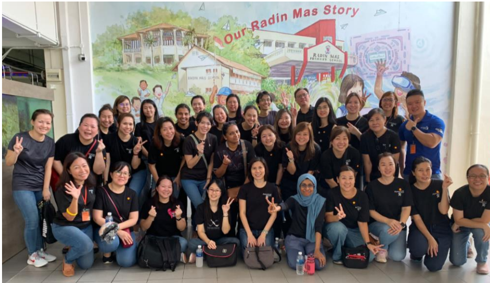
Children's Day Celebration