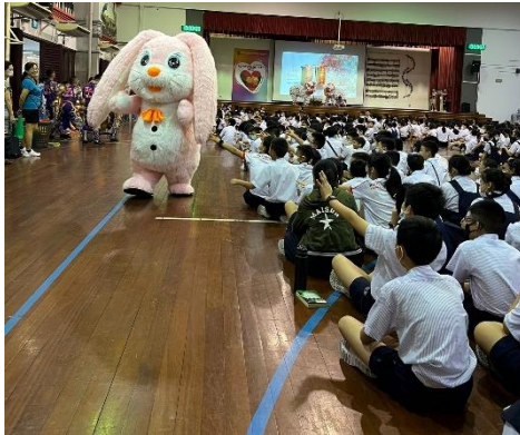
Chinese New Year