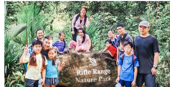
RMPS Walking Through History Tour @ Former Fort Factory