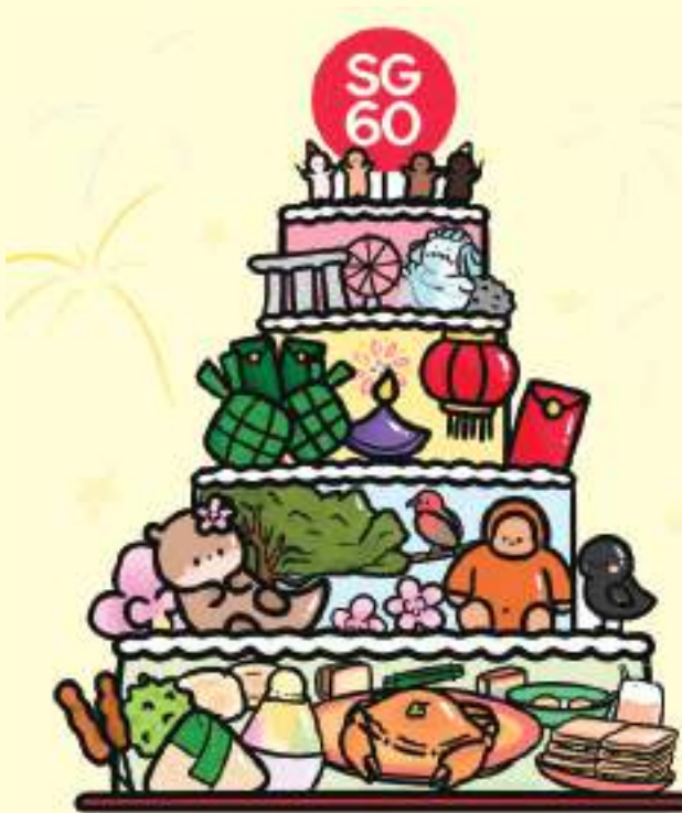
Images from Mediacorp's Design Pompi Competition ( https://www.sg60.mediacorp.sg/designpompi_winner/ )