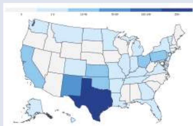
A map showing the number of measles cases in USA in 2025 as of 8 May.

I hope that the measles situation in America will improve, and the public will be more willing to get vaccinated against measles.