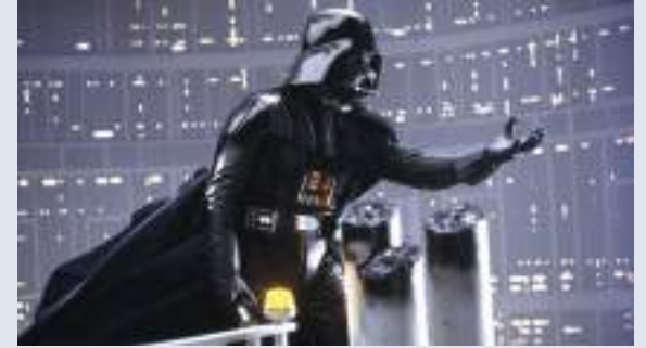
"No, I am your father." The iconic line from Star Wars: The Empire Strikes Back , voiced by Jones.

He will be missed by his fans. No one else sounds like James Earl Jones.