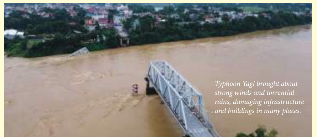
Typhoon Yagi brought about strong winds and torrential rains, damaging infrastructure and buildings in many places.

due to global warming, tropical storms seem to be forming closer to coasts, getting more intense and longer-lasting. Scientists study typhoons and climate change to understand these changes better. By learning more, they can predict storms and help communities prepare in order to reduce the damage and loss of lives, especially for developing countries and coastal communities.