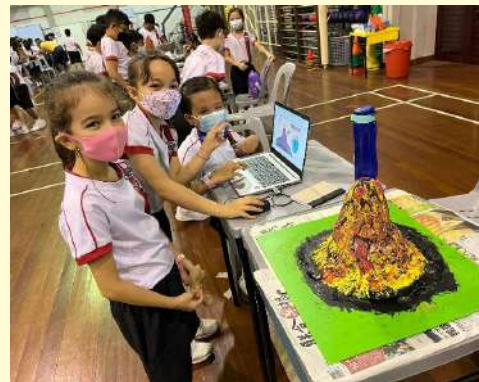
Teams are given the autonomy to present their solutions in various modes.