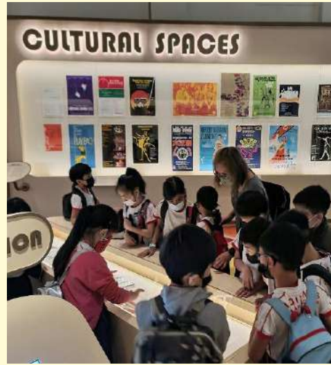
Students at the Voices of Singapore gallery at the National Museum discover how Singapore forged a unique voice for herself.

What I learned from this experience is that MDPW really gives us more opportunities to learn, to communicate and be creative while learning in a fun way. Overall, the more we use our heads to think... our hands to do... and our hearts to connect with others, the more we can become better students.