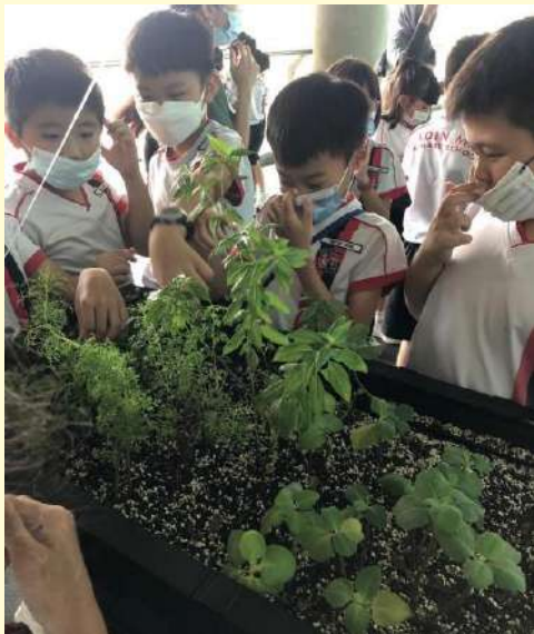
At the Marina Barrage, students see how Singapore has been working on growing vegetables despite our limitation in land space, including food that can even be grown in our homes.