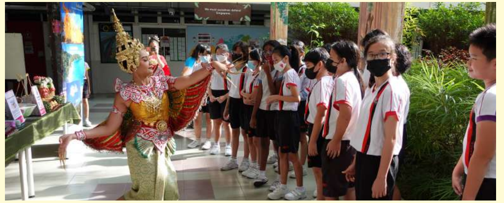
A performer in elaborate headdress and costume shows Primary 5 students the intricate hand movements in Thai dance.

We look forward to more of such virtual tours to other countries in the future!