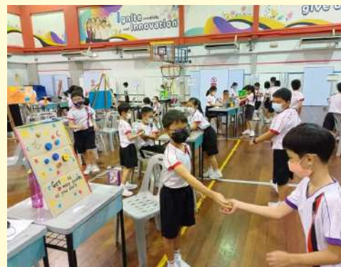
Students showcase the traditional games they made using recycled materials.