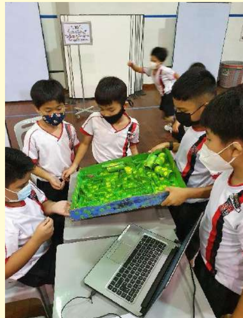
Students try out a game made by their schoolmates.