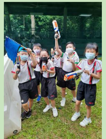
Ready for a Nerf Gun Showdown!

The trip to the Discovery Centre was so interesting. We learned facts about World War 2 and how Singapore gained its independence. We learned about the difficult times and the people who led Singapore such as our late Prime Minister Lee Kuan Yew. It was also very interactive and fun. My friends and I loved playing with different fun activities at the museum, especially the Battlefield Command and Situation Room, which challenged players to defend against conventional threats from land, air and sea, as well as complex threats like geostrategic conflicts, viruses and disaster outbreaks.