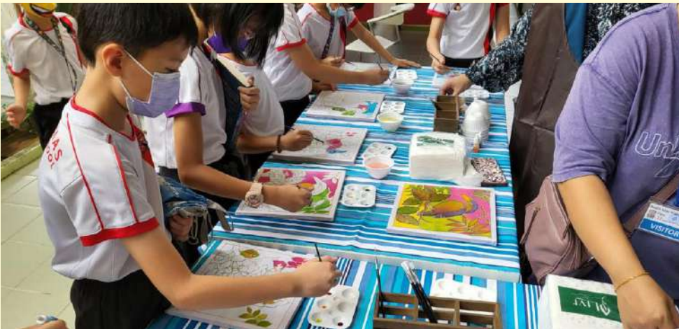
Murid-murid sedang mewarnakan batik semasa aktiviti waktu rehat sempena Hari Raya.

Apabila ditanya tentang rancangan masa hadapan, guru-guru Bahasa Melayu di Sekolah Rendah Radin Mas berharap agar dapat terus bekerjasama dan menyumbang kepada banyak lagi rumah-rumah kebajikan di Singapura.