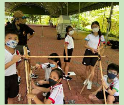
Teams work together to build a trebuchet.