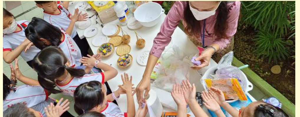
Primary 2 students try their hand at making food miniatures using dough.