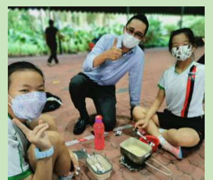
Offering our Principal a taste of the instant noodles that we cooked!