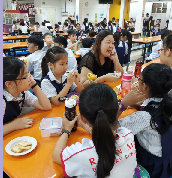
Breakfast with Form Teachers

Foster well-being in our students and develop positive relationships through engaging and meaningful conversations.