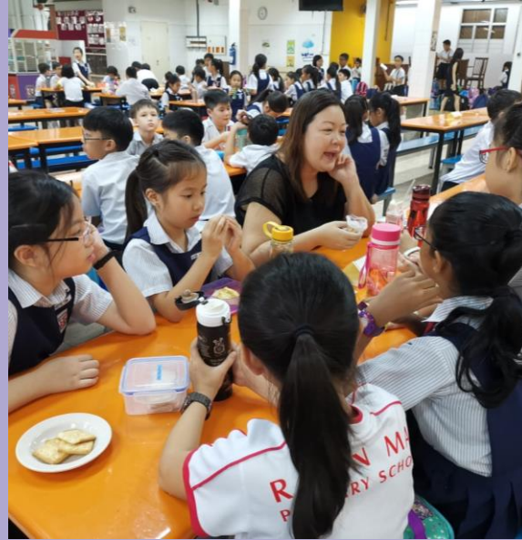
Breakfast with Form Teachers

Foster well-being in our students and develop positive relationships through engaging and meaningful conversations.